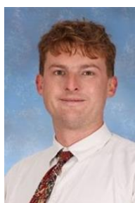
R Field Pastoral Leader