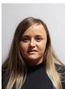
D Pretty Pastoral Leader